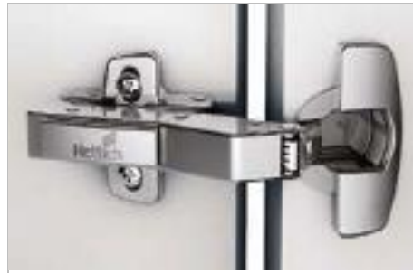
Sensys W45 angle hinge

Sensys 8639i W30 For 30° face angle applications