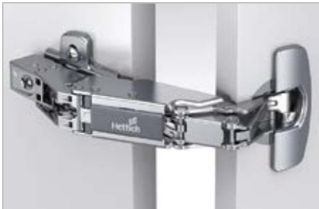
Sensys 165° zero protrusion hinge

Sensys 8639 W30 For 30° face angle applications