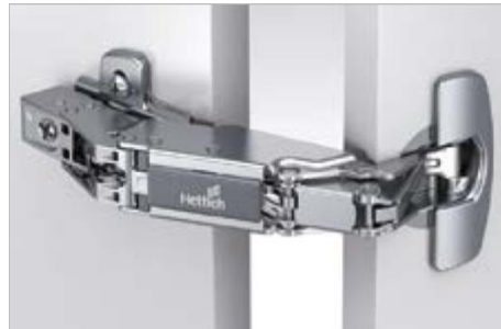
Sensys 165° zero protrusion hinge

Sensys 8657i For unobstructed access to storage space