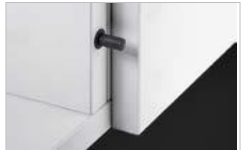
Push to Open Magnet