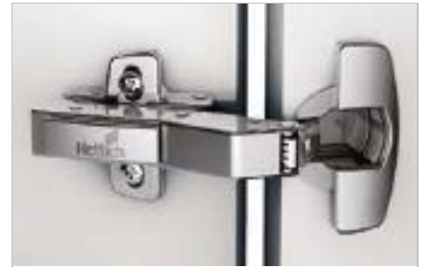
Sensys W45 angle hinge

Sensys 8657 For unobstructed access to storage space