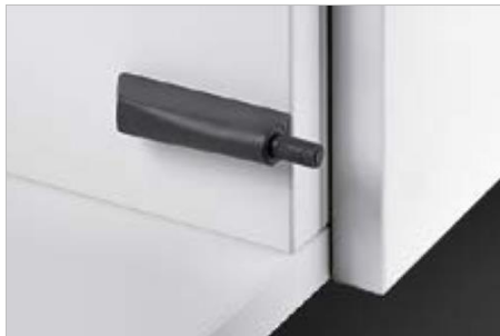
Push to open Magnet