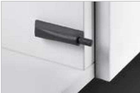
Push to Open Pin