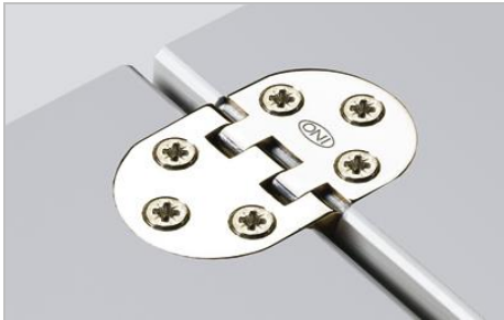
Flap Hinge 135 Flap Hinge 137 Special Hinge