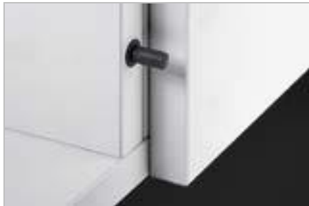
Push to Open Pin