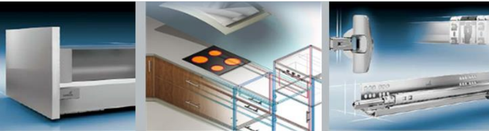
Hettich fitting groups in imos